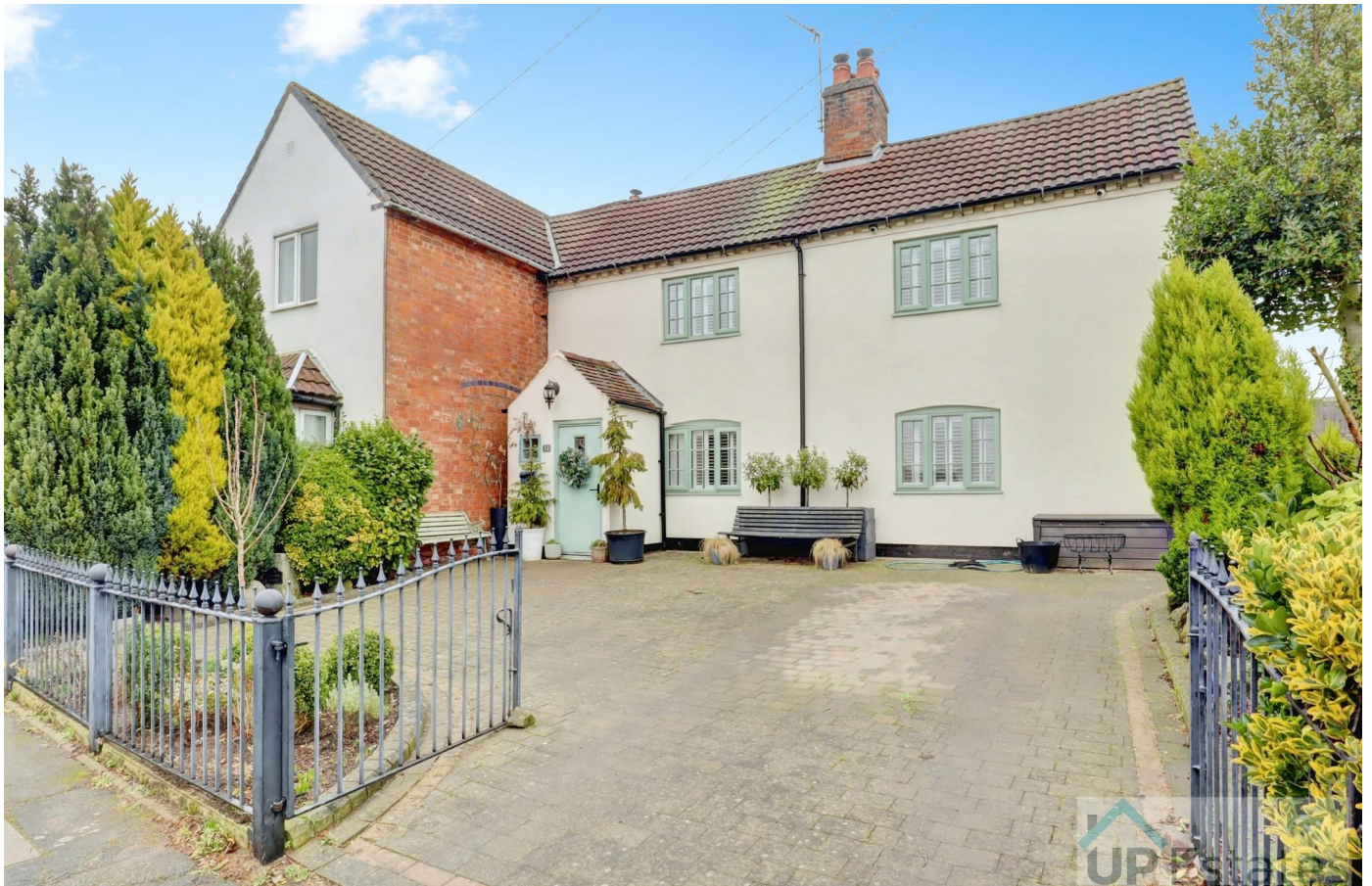
Church Street, Bulkington, Bedworth